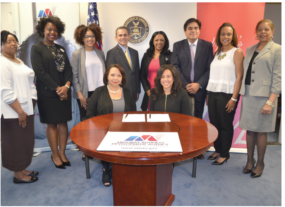
MBDA and Walker's Legacy Staff at MOU Signing

Vol 33, Edition 8 Weekly Publication May 18, 2017